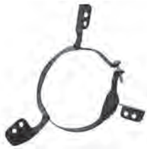
Adapter Kit 619432-174 for Fleximount